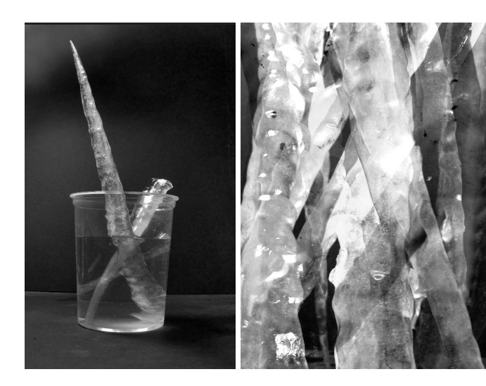
Figure 1: Sintering of Icicles

about modules that could start interlocking in a similar manner to the anti-tank barrier known as Czech Hedgehog.