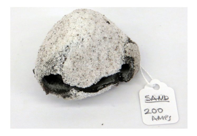
Figure 6: Typical electric arc fulgurite.

• Glass making is slow due in-part to long annealing times. Glass making with an electric arc is instant. Are there techniques that make