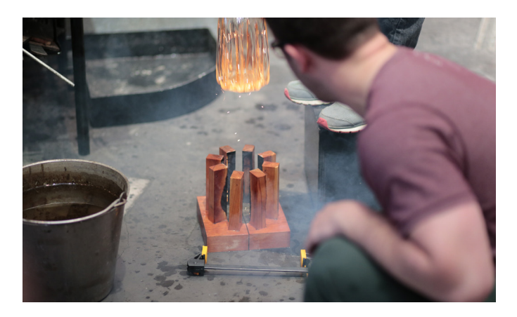
Figure 10: Hot glass prototyping of the glass block.