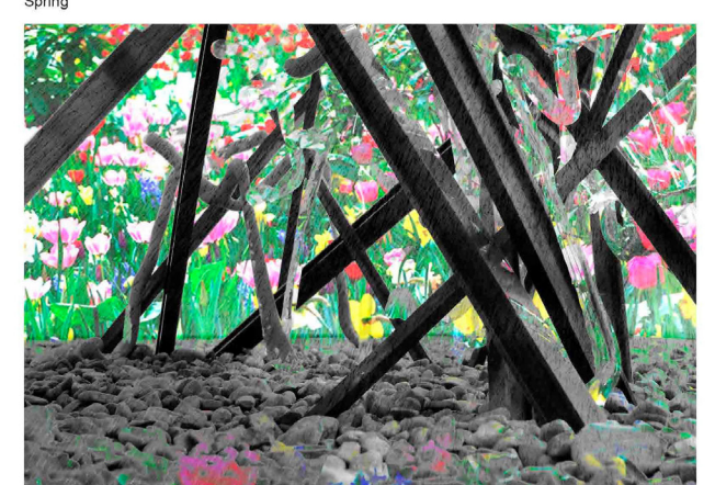
Figure 4: Self assembling spatial proposals with varying seasonal envelopes. (Images: Kim Sass, Steve Smigielski)

introduced. Modules over 2 ft. were made of wood and modules over 8 ft. were made of steel. The construction sequence followed the hierarchy of scales and materials. In the documented model, first, three steel modules with a diameter of 30 ft. are dropped on top of one another. Next, wood modules with an 8 ft. diameter are dropped onto the assembly. The third pour consists of glass modules with diameters ranging from 2 ft. down to 4 in., creating an outer crust. In contrast to standard constructions, this assembly does not require labor skills, is rapid and needs no fasteners. It is nearly self-assembling. In winter, snow and ice contribute to making a sealed envelope. In summer, growing vines provide shading. Each assembly/pour creates a geometrically different but typologically related structure. The assembly has no required tolerances.