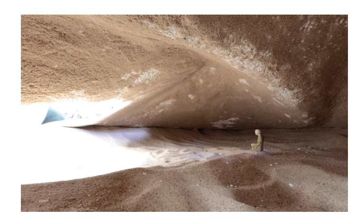
Figure 8: Spatial proposal for a monolithic glass structure.

architectural form from this specific glass fabrication process? If used for fabrication in areas where sand is already naturally occurring (coastal areas, deserts), then it might be helpful to think of sand also as a formwork material to stay true to a pure, monolithic glass concept of construction. Students conducted test to see what forms sand adopts when it accumulates through pouring. When centrically poured, cones form. The angle of the cones vary depending on the humidity of the sand. Dry sand form cones with 30-degree angles. Wet send can generate sand with steeper angles, up to 50-degrees. Electric arc fulgurites can be formed underneath the existing sand surface, withdrawn, pried open, and placed upon the formed sand cones that act as formwork. The glass artifacts would then be welded together through electric welding, forming a monolithic structure that consists of the same material as the surrounding natural environment. By digging out the interior sand, the glass shell remains. Damages to the structure could be repaired using the electric arc technique with the available material onsite. The structure could be demolished onsite by simply breaking it into smaller particles and mixing it back into the sur-rounding sand. Glass has an exceptionally long life span. When not mixed with other material, glass can retain this long material lifespan of thousands of years.