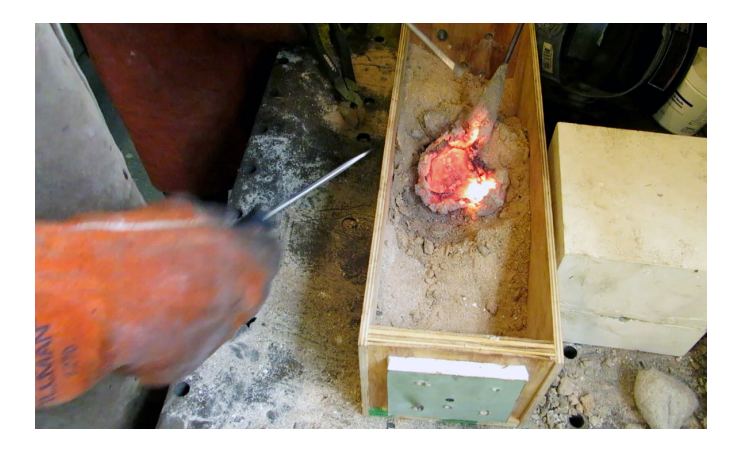
Figure 7: Fusing of glass fulgurites through the proposed electric arc method.

The electric arc proved to be a suitable tool to form glass instantly in small batches from raw materials. How could one think of creating