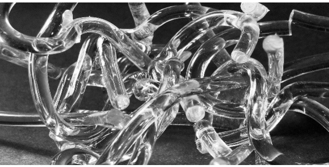
Figure 3: Assistive mold before and after firing (top). Aggregation of irregular modules shown at bottom image.

aided the aggregation process, similar to Velcro surfaces. To scale-up this approach to an architectural scale, two additional materials were